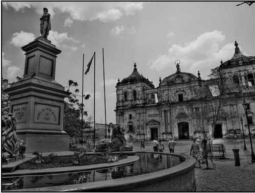
Catedral de la Asunción, León, Nicaragua